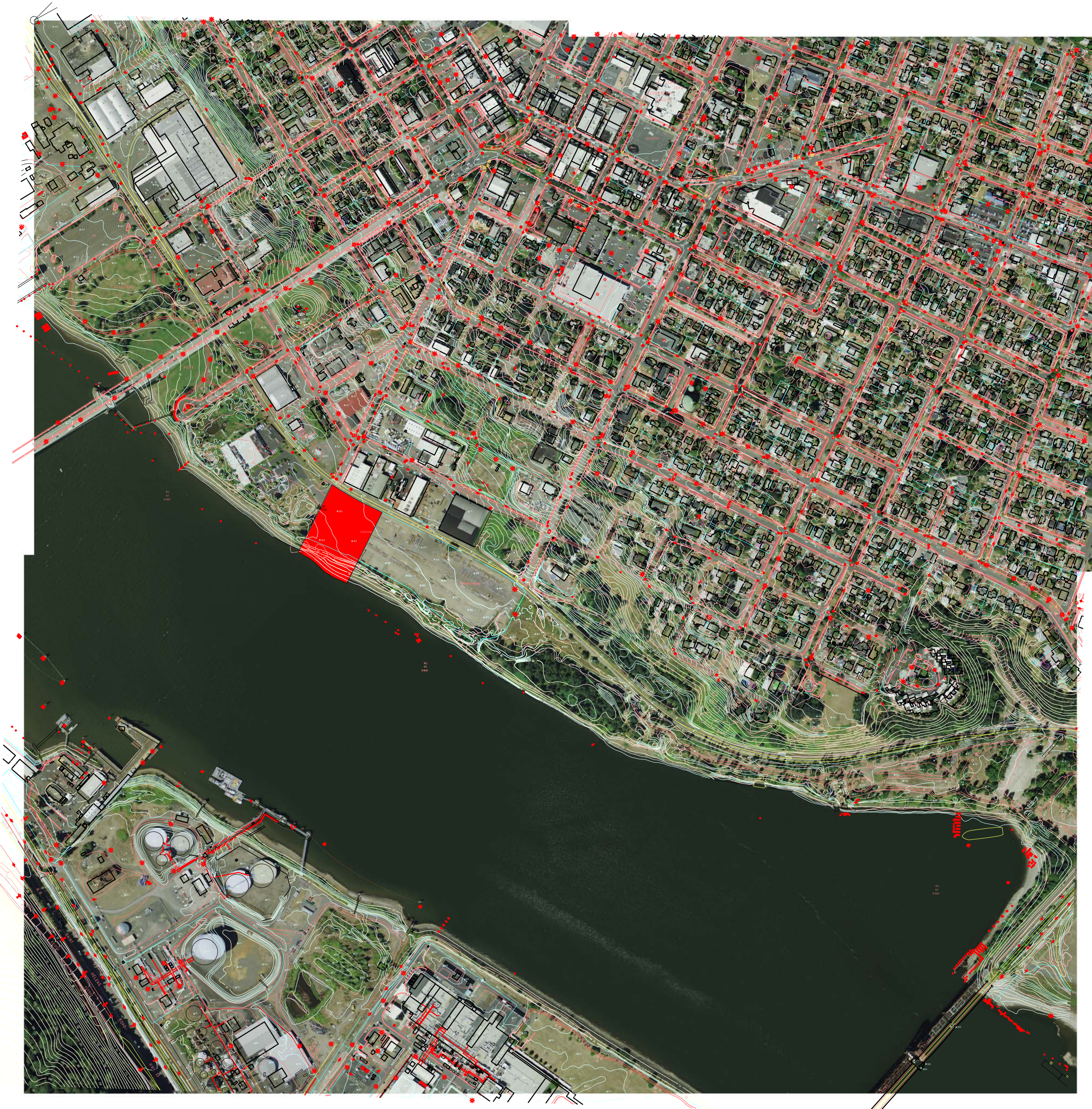
① SITE PLAN 1" = 400'-0"