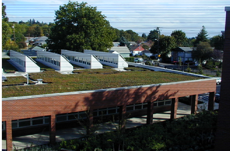
Green Roof at the Washington School for the Blind

Our branch's NEXT MEETING will be on May 10 – A presentation of sustainable projects performed by and for Washington State. Capital Project staff will discuss progress and status for the three types of sustainable construction; K-12 Schools, Affordable Housing and general construction.