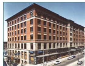
Come visit us at our new downtown office in the historic Colman Building. Features include daylighting and views from every seat, bike room and shower, operable windows, and easy access to all types of transportation