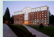
Navy Bachelor Enlisted Quarters, Bremerton, WA, LEED Certified.