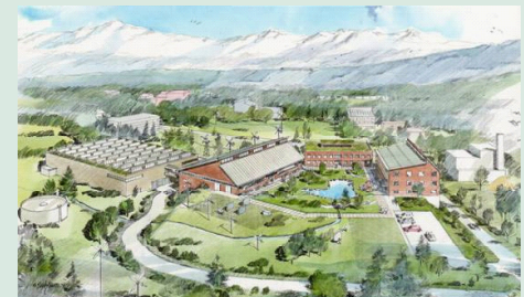
Kitsap Sustainable Energy and Economic Development Project, Bremerton, WA, targeting LEED Platinum.

And over thirty other projects pursuing LEED Certification, Silver, Gold, and Platinum.