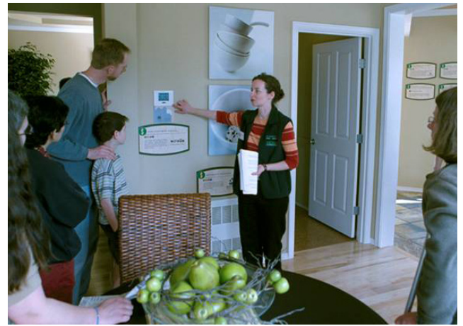
Visitors tour the Puget Sound Energy Built Green Idea Home, guided by O'Brien & Company staff. O'Brien & Company provides Energy Star and Built Green Consulting and Verification, and is consulting to over 100 units of LEED for Homes Pilot projects

O'Brien & Company focuses on informed sustainable development practices to build community across all market sectors and all types of stakeholders. From schools to multi-family, from labs to high-rises, we've got our finger in it all.