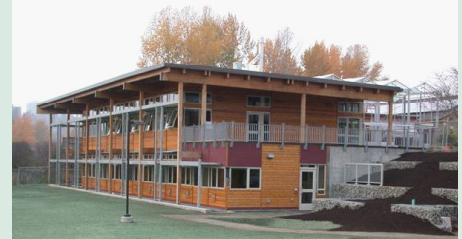
Merrill Hall, University of Washington, LEED Silver.